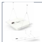
Pendel KIT 4607795