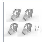
Clips KIT 4607788