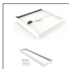
Surface KIT 4607764 4607771