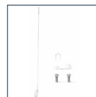
Security cable 4607801