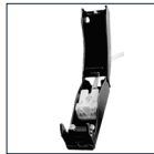
Junction box Included