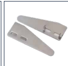
Blade clips 4607849