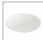
IP65 Kit round 4608129